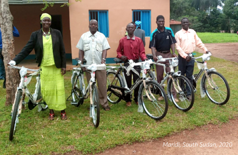
Maridi, South Sudan, 2020