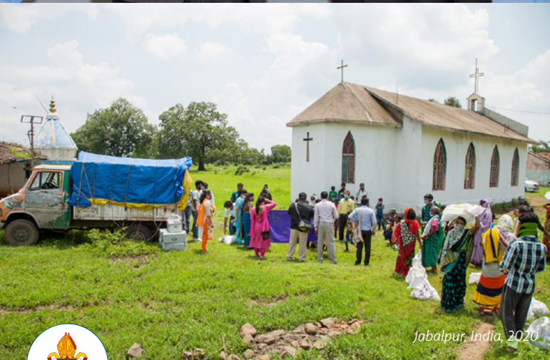
Jabalpur, India, 2020

Promoting Anglican voices speaking into and influencing key global forums, such as the United Nations and the European Institutions.